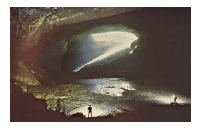
Fig. 5 . The Entrance Chamber of the Zhucaojing cave system looking west (Photo: Tony Baker).