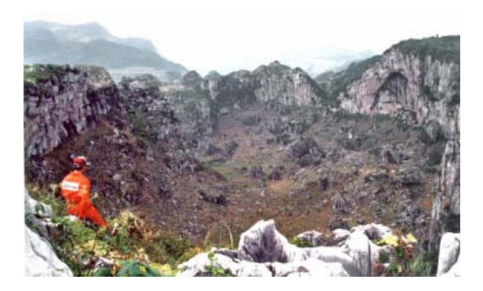
Fig. 4 . The degraded tiankeng of Dayanwan, seen from its eastern rim, with the edge of its deep internal doline visible in the foreground.