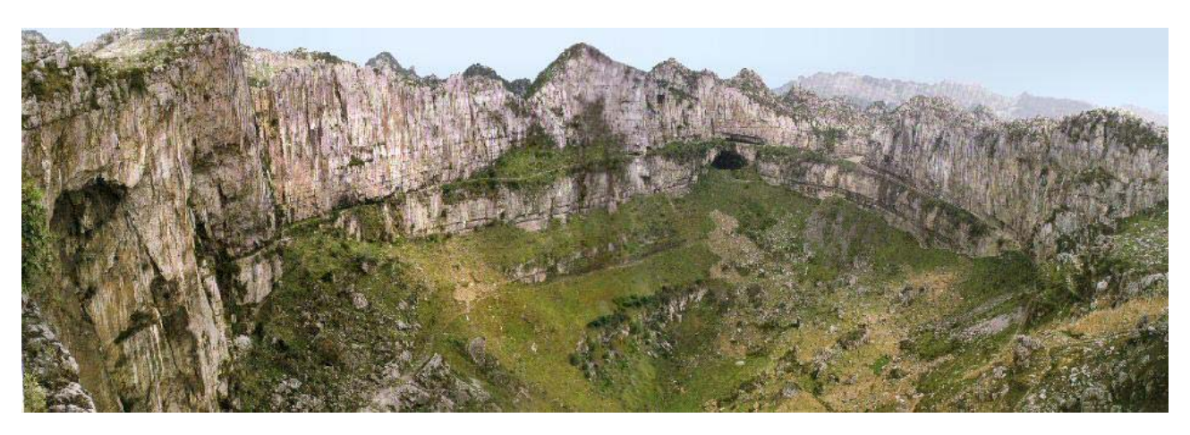
Fig. 2 . Looking east along the length of the Xiaoyanwan tiankeng; on the lower slopes, note the bedrock ribs on the north side (left) contrasting with the debris ramp on the south side (right).

Though the upper half of the tiankeng profile has vertical cliffs, the lower half tapers to a small, dry, grass-floored apex. Most of the lower slopes are ramps of scree that are covered by thin soil and vegetation, though there are some active runs of bare rock debris. Significantly, these lower slopes across the northern side of the tiankeng are broken by two bedrock cliffs (Fig. 2); the lower cliff is natural, but the upper scar has been enhanced by a vehicle track cut into it; small banks of scree stand between successive cliffs.