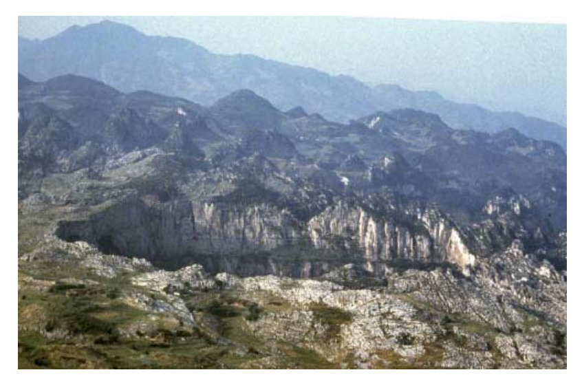
Fig. 1 . A distant view of Xiaoyanwan, seen from high on a mountain in the sandstone cover, with the crest of the Xingwen escarpment forming the nearer skyline profile.

This fine example of a mature tiankeng is a huge collapse doline ringed almost completely by vertical limestone cliffs over 100 m high. It is almost circular in plan, 625 m long and 475 m across, and its rim cuts through twelve conical hills and the intervening solution dolines within the karst. The highest point on the rim cliffs stands 248 m above the lowest point in the tiankeng, while the lowest col on the rim is still 178 m above the tiankeng floor. Its volume is therefore about 36M m<sup>3</sup>.